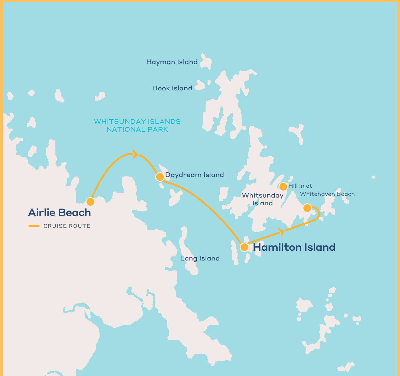
- Indicative route subject to weather and wind conditions

Explore the stunning Whitsunday Islands and enjoy the ultimate Whitehaven Beach experiences.