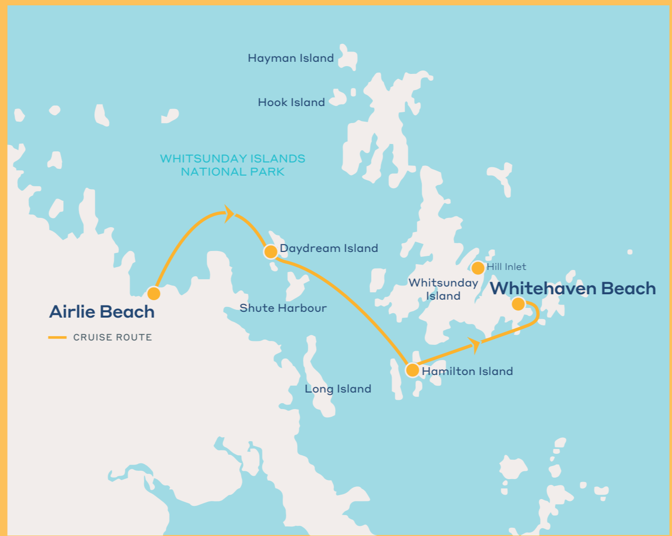
- Indicative route subject to weather and wind conditions

We acknowledge the Ngaro people as the Traditional Custodians of the land on which we work and live, and recognise their continuing connection to land, sea, and community. We pay our respects to Aboriginal and Torres Strait Islander peoples and to Elders past, present, and emerging.